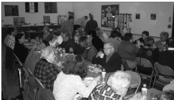
The Volunteer Recognition Banquet was well attended by a large variety of people and groups.

service on our Board of Directors. Our volunteers log in approximately 6000 hours of service to the community annually